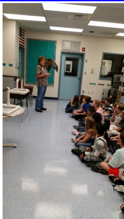
Hobe Sound Nature Center visited our Fourth graders.