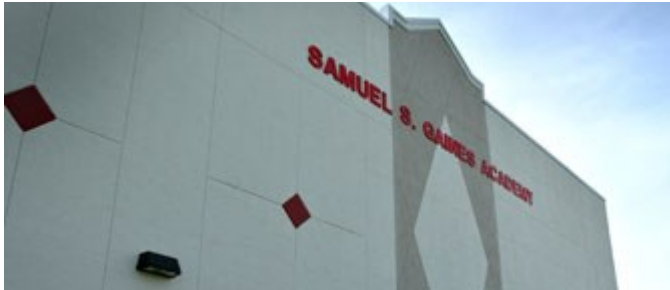
2250 S. Jenkins Road, Ft. Pierce, FL, 34947