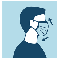
Proper Mask Wearing

Visit us on Facebook at: Mariposastluciepublicschools