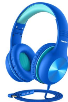
Nylon Braided Cords preferred