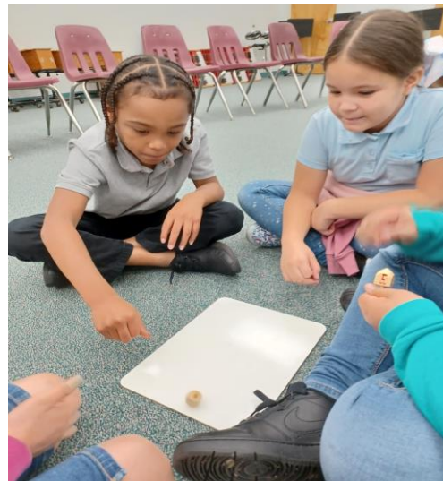
Students Playing the dreidel game!