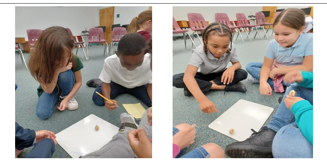
Students Playing the dreidel game!

The second nine weeks brought many Fall and holiday activities. These activities included pass the pumpkin games with instruments and boomwhackers. The upper grades studied French composer Camille Saint-Saens and learned to play one of his songs on claves. December brought the study of three holidays. The lower grades spent many weeks preparing for their presentation of "Holiday Alphabet" on December 8th. The students worked hard to the delight of the large and appreciative audience.